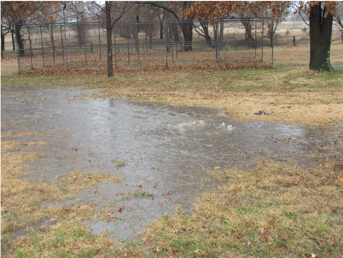
Fig. 1 Sewer overflow to the environment - 2010

The first IWS staff member observing or being made aware of a pollution incident must notify all relevant authorities about the incident, not just the appropriate regulatory authority (ARA) under the POEO Act. For sewage overflow incidents these include the Environment Protection Authority and the Ministry of Health. All staff becoming aware of an incident must ensure that the required notifications have been made.