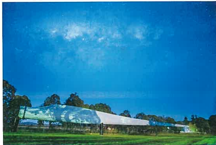
Figure 3 Blade Installation

Strategic reviews of this POM for Lex Ritchie Park will occur at four (4) year intervals. The Appendices to this POM may be updated from time to time, reflecting significant changes to the condition of the community land or to reflect changes in legislation. The community will have an opportunity to participate in reviews of this POM as part of the Council community consultation process.