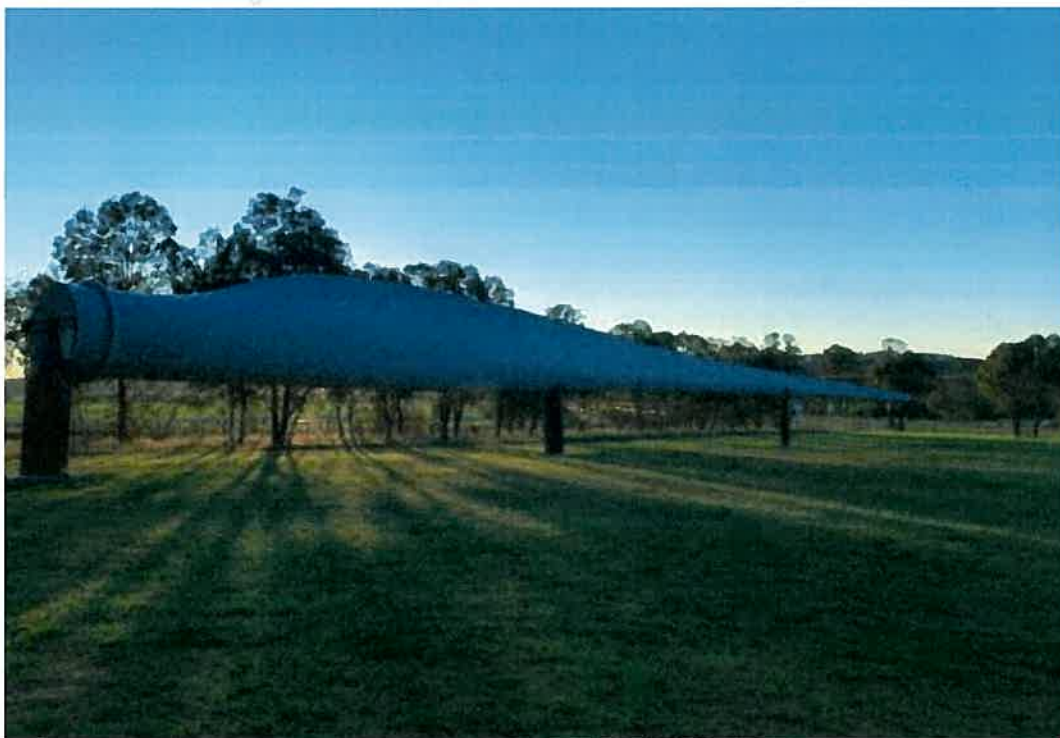
Figure 2 Blade Installation

Installation of a picnic shelter with seating is being undertaken by the local Rotary Club and consideration will be given to areas for long vehicles to park, with areas already identified as possibilities in Greenaway Street.