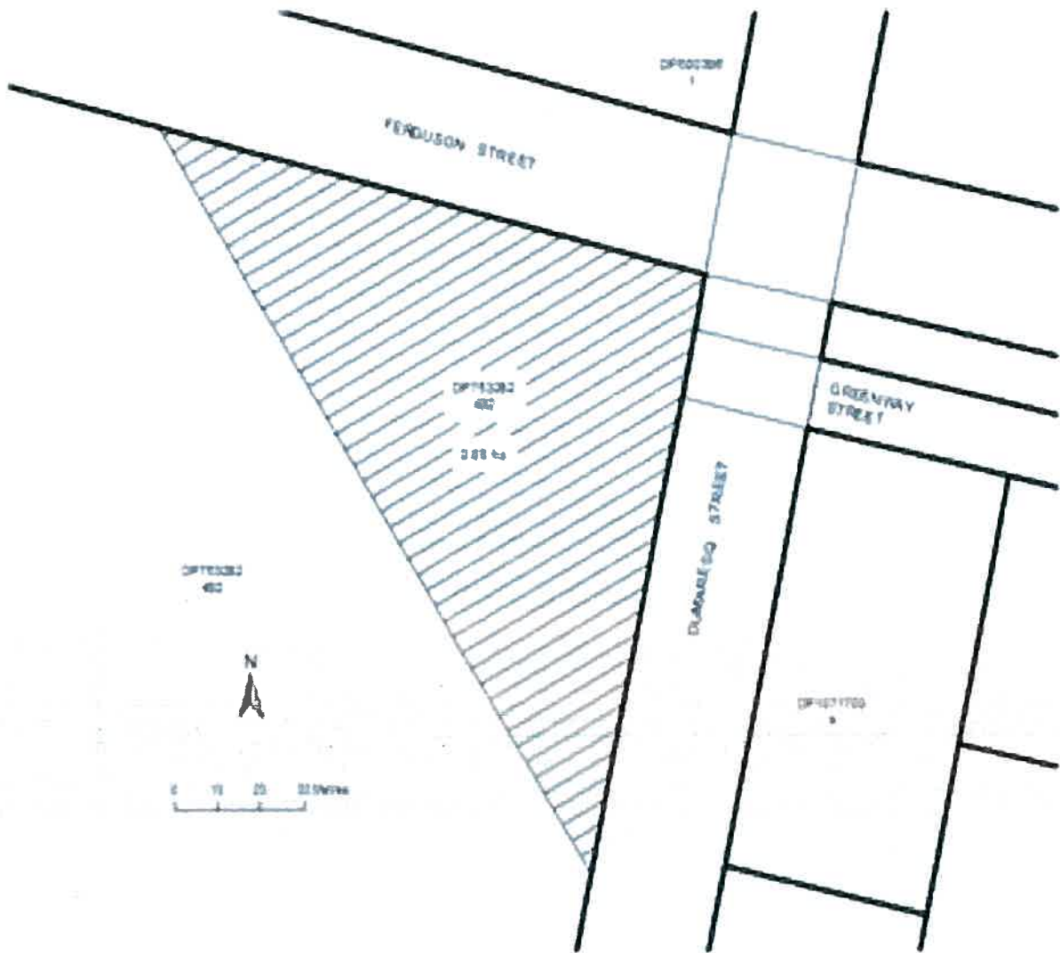
Figure 1 Location