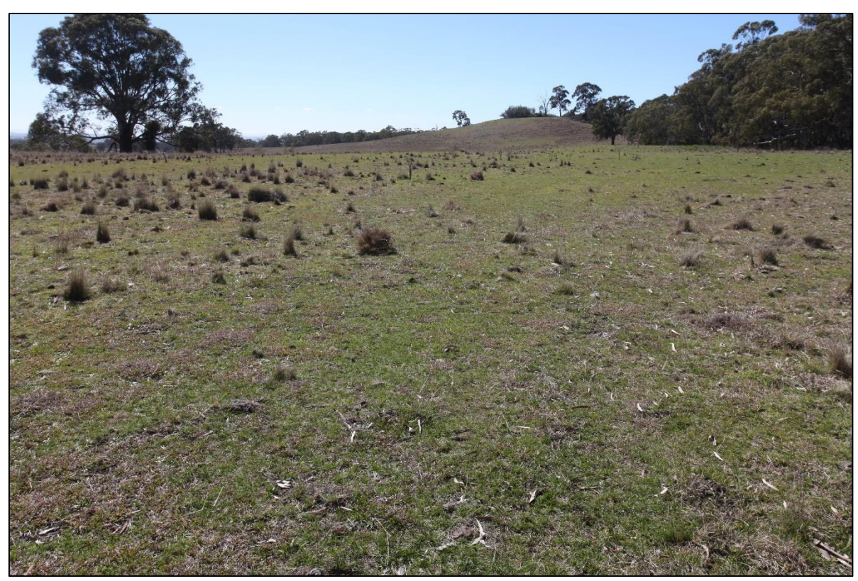
Figure 3: Typical vegetation of the Quarry area (looking east).

For purposes of analysis the Quarry Area is treated as two separate landform units, being ridge crests and slopes (Figure 3 and Figure 4). The Quarry Area was predominately located on a steep slope with only the southern section comprising ridge crest, which in this instance was very flat. The remainder of the Project site comprised moderately step slopes, ridge crests and large outcrops of basalt. A summary of the landscape features and broad disturbance types within each survey unit are listed in Table 1.