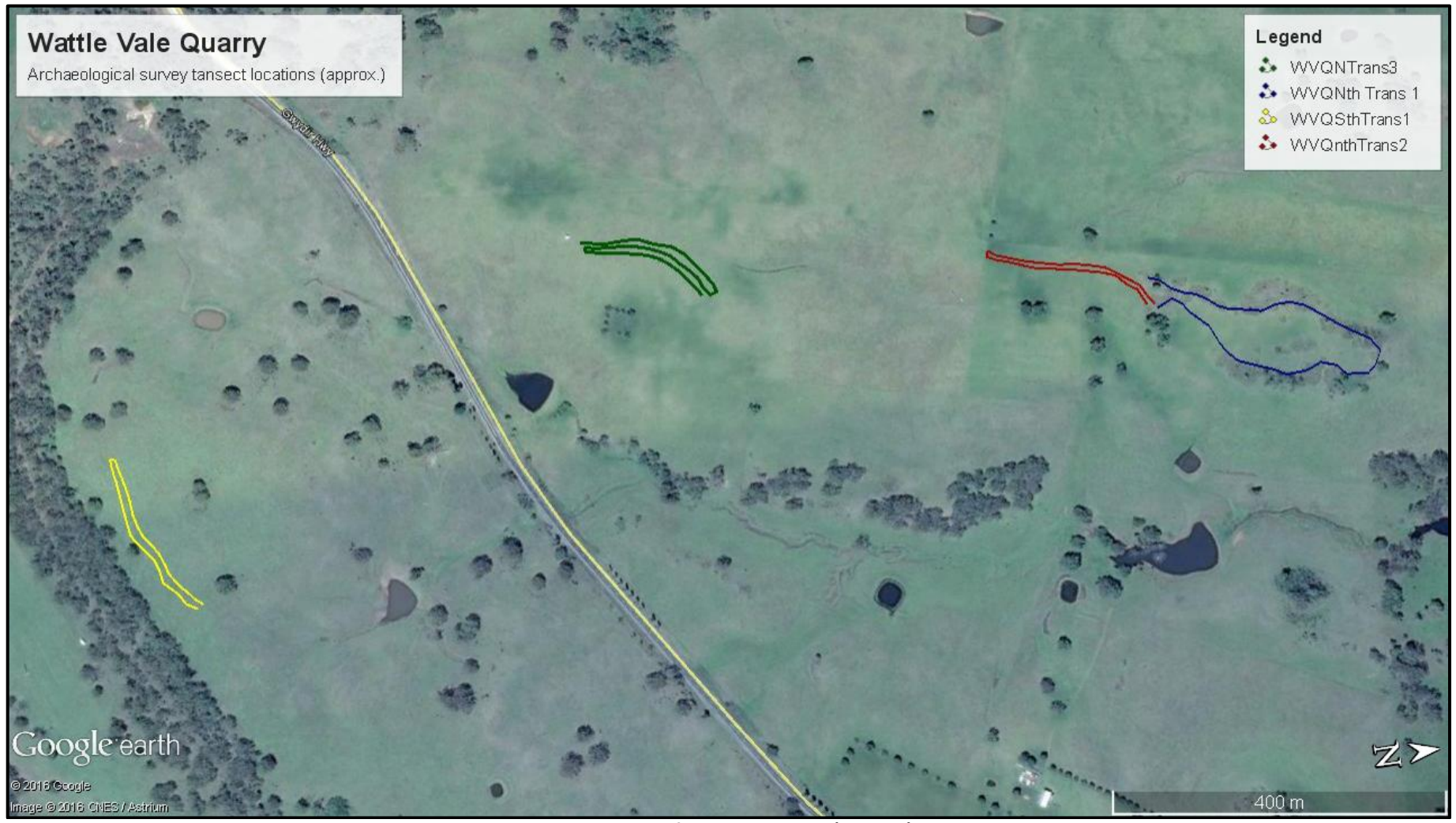
Figure 5: Map of survey transects (approx.).