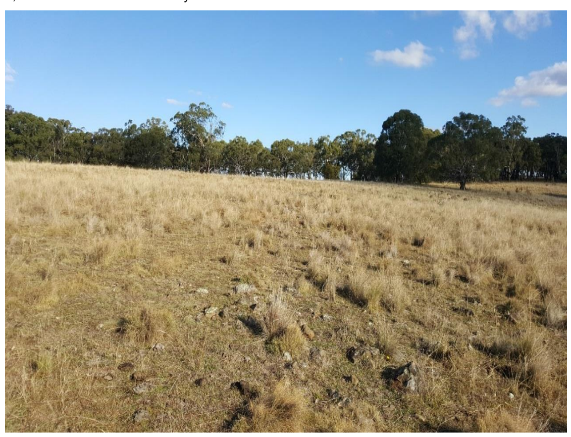
Plate 3-1 Southern portion of the study area

The study area is approximately 8 hectares in area which includes an extraction area of approximately 7.76 hectares and sits on undulating pasture land on the edge of the Waterloo range, a low lying north-south belt of hills to the west of Glen Innes (see Plate 3-1 below). The surrounding area is relatively sparsely populated. The closest residence lies approximately 1,200 m to the east of the study area.