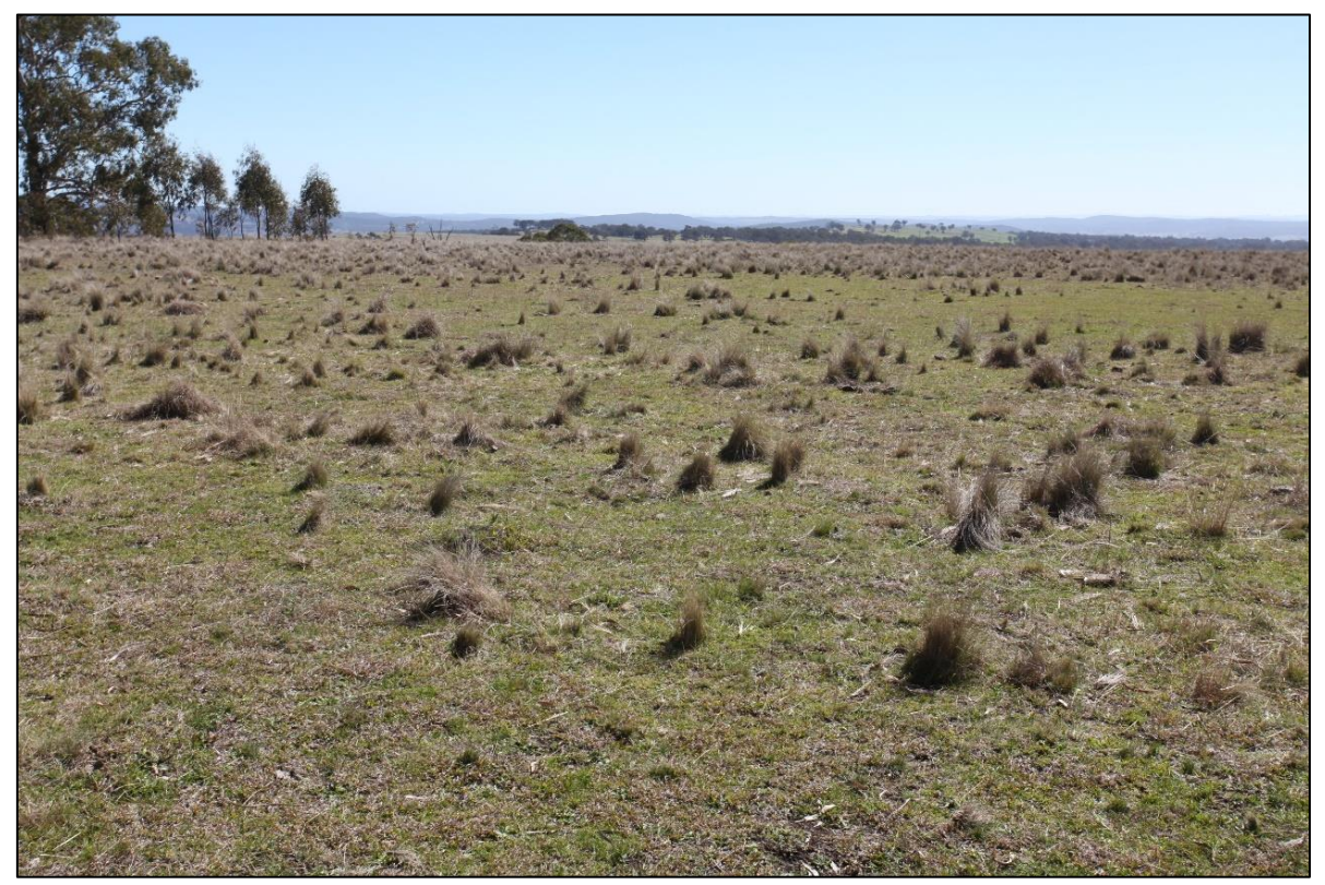
Figure 4: Typical vegetation of the Quarry area (looking west).