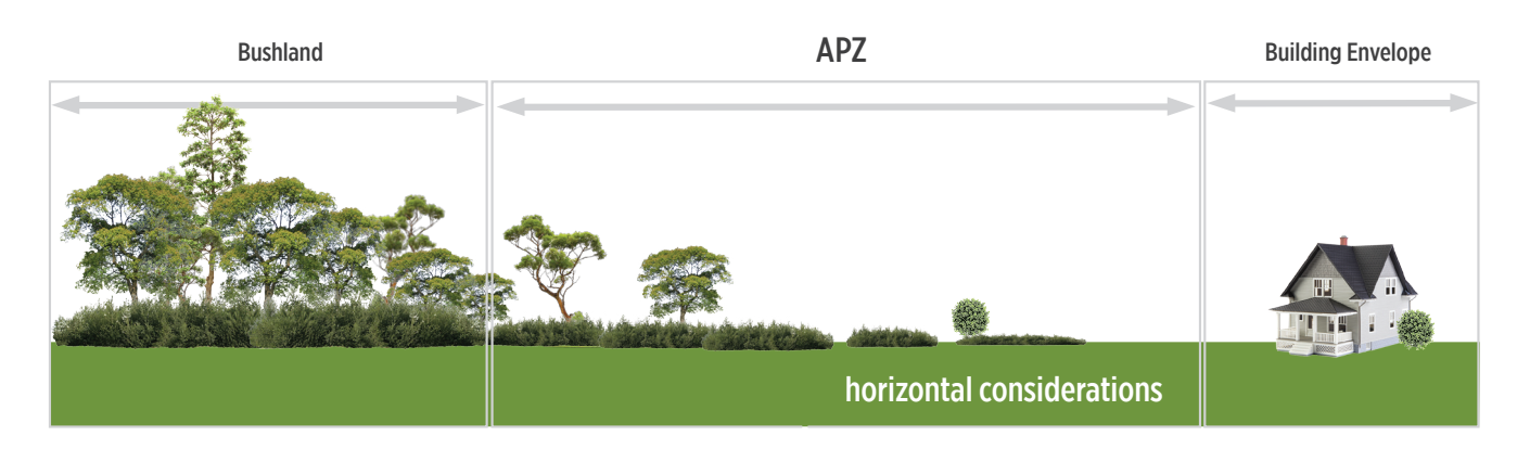
Figure 7 Asset Protection Zone (APZ)

Although it is possible to build using BAL-Flame Zone construction levels, providing a minimum defendable space and APZs wherever possible will increase the resilience of your home in bush fire situations.