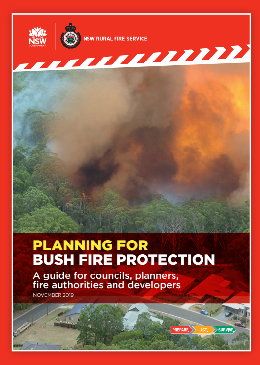
Fig 1. RFS publication Planning for Bush Fire Protection 2019.

This kit takes you through each step in the bush fire assessment process and explains how to complete the Bush Fire Assessment Report (BFAR) which will need to accompany your Development Application (DA). This document is intended for use only where the proposed development are on existing land having a dwelling entitlement and where no new infrastructure for example roads and hydrant systems are required. Where the intention is to increase the residential density of a site like dual occupancies, multiple dwellings, boarding homes, workers cottages and any other similar proposals, a bush fire assessment report may be required for existing development. Furthermore, it is intended for use only where the bush fire assessment is straightforward from a vegetation classification and slope calculations being considered. For other situations, the services of a suitably qualified bush fire consultant should be obtained.