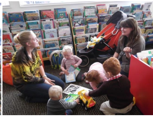
Young families enjoying the Children's Room