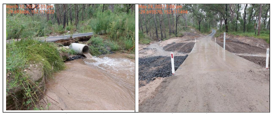
Image 1 - Completion of the new causeway on Stirrup Iron Creek Road

Multiple contractors have been engaged to assist in the emergency recovery efforts. The goal is to again have all of our roads accessible to two-wheel drive vehicles by the end of June.